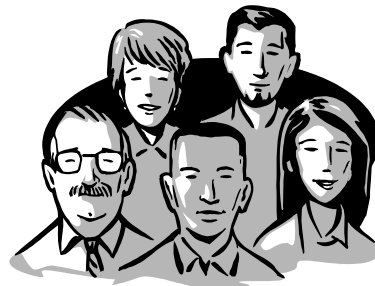
Are you ready to serve on the Board of Director for PWLF?

To help ensure continuity of service and administration, a split is maintained in